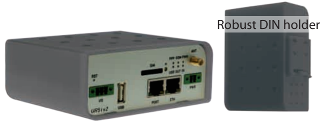
Version in plastic housing