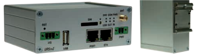
Version SL - metal housing