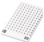
Marker card, Card, can be ordered: by card, white, labeled according to customer specifications, mounting type: adhesive, for terminal block width: 4.15 mm, lettering field size: continuous x 3.8 mm

Marker card - SK 3,8 REEL P4,15 WH CUS - 0825990