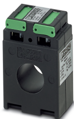
Bus-bar current transformer, 50 A AC primary current; 5 A AC secondary current; accuracy class 1; 1.25 VA rated power

Please be informed that the data shown in this PDF Document is generated from our Online Catalog. Please find the complete data in the user's documentation. Our General Terms of Use for Downloads are valid ( http://phoenixcontact.com/download )