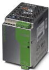
DIN rail power supply unit 24 V DC/10 A, primary switched-mode, 1-phase.

Please be informed that the data shown in this PDF Document is generated from our Online Catalog. Please find the complete data in the user's documentation. Our General Terms of Use for Downloads are valid ( http://phoenixcontact.com/download )