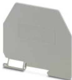
Partition plate, length: 99 mm, width: 2 mm, height: 90 mm, color: gray

Please be informed that the data shown in this PDF Document is generated from our Online Catalog. Please find the complete data in the user's documentation. Our General Terms of Use for Downloads are valid ( http://phoenixcontact.com/download )