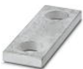
Connection rail, number of positions: 2, color: silver