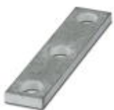
Connection rail, number of positions: 3, color: silver