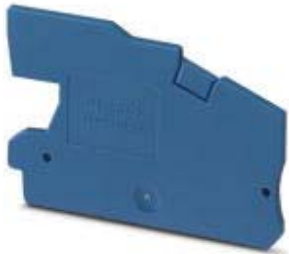
End cover, Length: 59 mm, Width: 2.2 mm, Color: blue

Please be informed that the data shown in this PDF Document is generated from our Online Catalog. Please find the complete data in the user's documentation. Our General Terms of Use for Downloads are valid ( http://phoenixcontact.com/download )