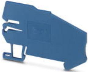
Support bracket, length: 77.7 mm, width: 2.2 mm, height: 43.4 mm, color: blue

Please be informed that the data shown in this PDF Document is generated from our Online Catalog. Please find the complete data in the user's documentation. Our General Terms of Use for Downloads are valid ( http://phoenixcontact.com/download )