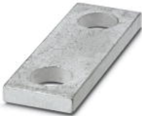
Connection rail, number of positions: 2, color: silver

Please be informed that the data shown in this PDF Document is generated from our Online Catalog. Please find the complete data in the user's documentation. Our General Terms of Use for Downloads are valid ( http://phoenixcontact.com/download )