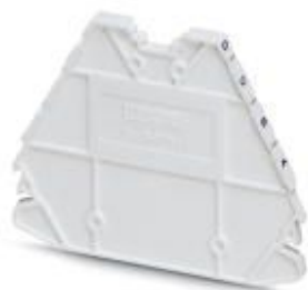
End cover, length: 63.6 mm, width: 2.2 mm, height: 48.9 mm, color: white

Please be informed that the data shown in this PDF Document is generated from our Online Catalog. Please find the complete data in the user's documentation. Our General Terms of Use for Downloads are valid ( http://phoenixcontact.com/download )