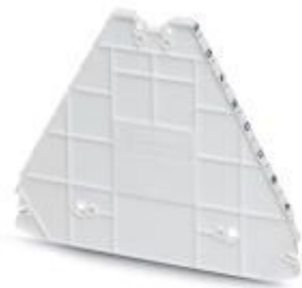
End cover, length: 100 mm, width: 2.2 mm, height: 80.8 mm, color: white

Please be informed that the data shown in this PDF Document is generated from our Online Catalog. Please find the complete data in the user's documentation. Our General Terms of Use for Downloads are valid ( http://phoenixcontact.com/download )