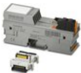
Left-alignable Ethernet interface, for connection to a compatible modular controller from the PLCnext Control range.

Extension module - AXC F XT ETH 1TX - 2403115