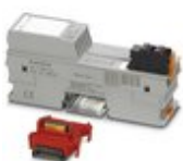
Axioline F, Power module for the logic supply U_{\text{Bus}} , max. 4 A, degree of protection: IP20, including bus base module and Axioline F connector