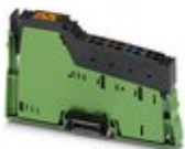
Right-alignable Inline adapter terminal (INTERBUS master) for one PLCnext Control device for setting up a PLCnext Technology Inline station

Extension module - AXC F IL ADAPT - 1020304