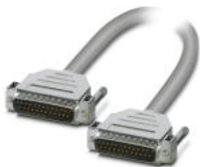
Assembled shielded round cable; connection 1: D-SUB pin strip (1x 25-position); connection 2: D-SUB pin strip (1x 25-position); cable length: 3 m

Please be informed that the data shown in this PDF Document is generated from our Online Catalog. Please find the complete data in the user's documentation. Our General Terms of Use for Downloads are valid ( http://phoenixcontact.com/download )