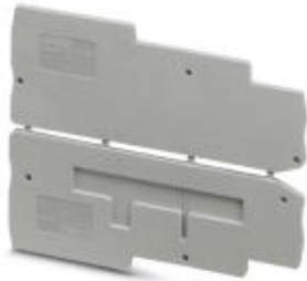
End cover, Length: 90.8 mm, Width: 2.2 mm, Height: 33.8 mm, Color: gray

Please be informed that the data shown in this PDF Document is generated from our Online Catalog. Please find the complete data in the user's documentation. Our General Terms of Use for Downloads are valid ( http://phoenixcontact.com/download )