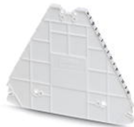
End cover, length: 100 mm, width: 2.2 mm, height: 80.8 mm, color: white

Please be informed that the data shown in this PDF Document is generated from our Online Catalog. Please find the complete data in the user's documentation. Our General Terms of Use for Downloads are valid ( http://phoenixcontact.com/download )