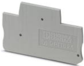
End cover, Length: 68 mm, Width: 2.2 mm, Color: gray

Please be informed that the data shown in this PDF Document is generated from our Online Catalog. Please find the complete data in the user's documentation. Our General Terms of Use for Downloads are valid ( http://phoenixcontact.com/download )