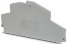
The figure shows a similar product

End cover, length: 96 mm, width: 2.2 mm, height: 46.8 mm, color: gray