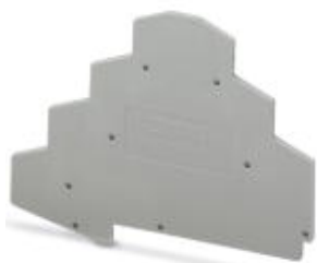
End cover, Length: 98.5 mm, Width: 2.2 mm, Height: 73 mm, Color: gray

Please be informed that the data shown in this PDF Document is generated from our Online Catalog. Please find the complete data in the user's documentation. Our General Terms of Use for Downloads are valid ( http://phoenixcontact.com/download )