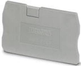
End cover, Length: 48.6 mm, Width: 2.2 mm, Height: 29.1 mm, Color: gray

Please be informed that the data shown in this PDF Document is generated from our Online Catalog. Please find the complete data in the user's documentation. Our General Terms of Use for Downloads are valid ( http://phoenixcontact.com/download )