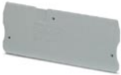
End cover, Length: 90.5 mm, Width: 2.2 mm, Height: 43.5 mm, Color: gray

Please be informed that the data shown in this PDF Document is generated from our Online Catalog. Please find the complete data in the user's documentation. Our General Terms of Use for Downloads are valid ( http://phoenixcontact.com/download )