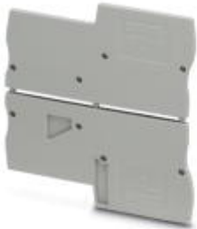
End cover, Length: 72.5 mm, Width: 2.2 mm, Color: gray

Please be informed that the data shown in this PDF Document is generated from our Online Catalog. Please find the complete data in the user's documentation. Our General Terms of Use for Downloads are valid ( http://phoenixcontact.com/download )