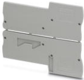
End cover, Length: 90 mm, Width: 2.2 mm, Color: gray

Please be informed that the data shown in this PDF Document is generated from our Online Catalog. Please find the complete data in the user's documentation. Our General Terms of Use for Downloads are valid ( http://phoenixcontact.com/download )