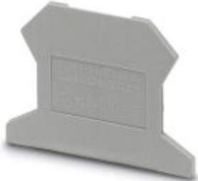
End cover, Length: 42.5 mm, Width: 1.5 mm, Height: 30.7 mm, Color: gray

Please be informed that the data shown in this PDF Document is generated from our Online Catalog. Please find the complete data in the user's documentation. Our General Terms of Use for Downloads are valid ( http://phoenixcontact.com/download )