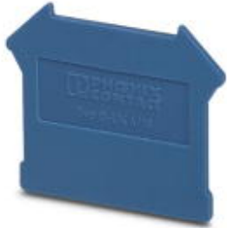
End cover, Length: 42.5 mm, Width: 1.8 mm, Height: 47 mm, Color: blue

Please be informed that the data shown in this PDF Document is generated from our Online Catalog. Please find the complete data in the user's documentation. Our General Terms of Use for Downloads are valid ( http://phoenixcontact.com/download )