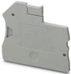
End cover, Length: 47.6 mm, Width: 2.2 mm, Height: 39.8 mm, Color: gray

Please be informed that the data shown in this PDF Document is generated from our Online Catalog. Please find the complete data in the user's documentation. Our General Terms of Use for Downloads are valid ( http://phoenixcontact.com/download )