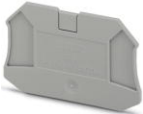
End cover, Length: 65.4 mm, Width: 2.2 mm, Height: 47.5 mm, Color: gray

Please be informed that the data shown in this PDF Document is generated from our Online Catalog. Please find the complete data in the user's documentation. Our General Terms of Use for Downloads are valid ( http://phoenixcontact.com/download )