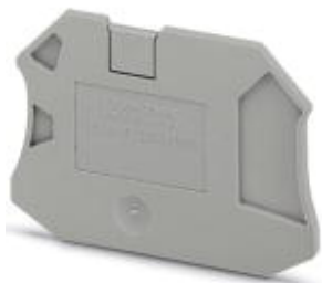
End cover, Length: 57.8 mm, Width: 2.2 mm, Height: 47.5 mm, Color: gray

Please be informed that the data shown in this PDF Document is generated from our Online Catalog. Please find the complete data in the user's documentation. Our General Terms of Use for Downloads are valid ( http://download.phoenixcontact.com )