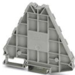
Spacer plate, length: 100 mm, width: 8.3 mm, height: 86 mm, color: gray

Please be informed that the data shown in this PDF Document is generated from our Online Catalog. Please find the complete data in the user's documentation. Our General Terms of Use for Downloads are valid ( http://phoenixcontact.com/download )