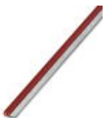
Continuous plug-in bridge, length: 500 mm, color: red

Continuous plug-in bridge - FBST 500-PLC RD - 2966786