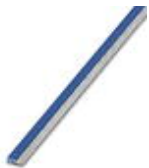
Continuous plug-in bridge, length: 500 mm, color: blue

Continuous plug-in bridge - FBST 500-PLC BU - 2966692