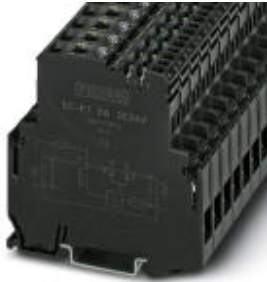
Electronic circuit breaker, signal contact: 1 N/O contact, nominal current: 6 A

Please be informed that the data shown in this PDF Document is generated from our Online Catalog. Please find the complete data in the user's documentation. Our General Terms of Use for Downloads are valid ( http://phoenixcontact.com/download )