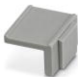
Equipment marker, width 12 mm

Marking material - EMG-SGKS 10 - 2947585