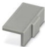
Equipment marker tag, width 22 mm