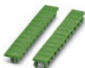
Terminal block/screw cover, set consisting of 50 strips each for terminal blocks and screw openings, 1 strip covers 12 terminal points.