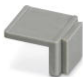
Equipment marker, narrow

Marking material - EMG-SGKS 10 - 2947585