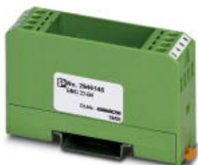
Custom circuit module, consisting of housing, MKDS 3 connection terminal blocks and PCB

Please be informed that the data shown in this PDF Document is generated from our Online Catalog. Please find the complete data in the user's documentation. Our General Terms of Use for Downloads are valid ( http://phoenixcontact.com/download )