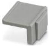
Equipment marker, width 12 mm

Marking material - EMG-SGKS 10 - 2947585