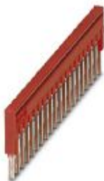
Plug-in bridge, pitch: 3.5 mm, number of positions: 20, color: red

Please be informed that the data shown in this PDF Document is generated from our Online Catalog. Please find the complete data in the user's documentation. Our General Terms of Use for Downloads are valid ( http://phoenixcontact.com/download )