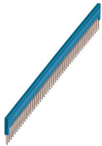
Plug-in bridge, pitch: 3.5 mm, number of positions: 50, color: blue

Please be informed that the data shown in this PDF document is generated from our Online Catalog. Please find the complete data in the user documentation. Our General Terms of Use for Downloads are valid.