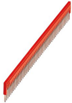
Plug-in bridge, pitch: 3.5 mm, number of positions: 50, color: red

Please be informed that the data shown in this PDF document is generated from our Online Catalog. Please find the complete data in the user documentation. Our General Terms of Use for Downloads are valid.