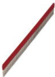
Plug-in bridge, Pitch: 5.2 mm, Number of positions: 50, Color: red

Please be informed that the data shown in this PDF Document is generated from our Online Catalog. Please find the complete data in the user's documentation. Our General Terms of Use for Downloads are valid ( http://phoenixcontact.com/download )