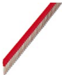
Plug-in bridge, pitch: 6.2 mm, width: 308.3 mm, number of positions: 50, color: red

Please be informed that the data shown in this PDF Document is generated from our Online Catalog. Please find the complete data in the user's documentation. Our General Terms of Use for Downloads are valid ( http://phoenixcontact.com/download )