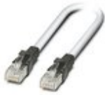
Patch cable, CAT5, assembled, 1 m

Patch cable - FL CAT5 PATCH 1,0 - 2832276