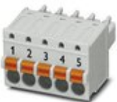
PCB connector, nominal cross section: 1.5 mm 2 , color: light gray, nominal current: 8 A, rated voltage (III/2): 160 V, contact surface: Tin, type of contact: Female connector, number of potentials: 5, number of rows: 1, number of positions: 5, number of connections: 5, product range: FK-MCP 1,5/..-ST, pitch: 3.81 mm, connection method: Push-in spring connection, conductor/PCB connection direction: 0 °, number of solder pins per potential: 1, plug-in system: MINI COMBICON, Locking: without, mounting: without, type of packaging: packed in cardboard

Printed-circuit board connector - FK-MCP 1,5/ 5-ST-3,81GY35BD1-5 - 1015782