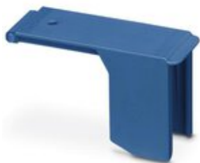
Covering hood, length: 144 mm, width: 41 mm, height: 33 mm, color: blue

Please be informed that the data shown in this PDF Document is generated from our Online Catalog. Please find the complete data in the user's documentation. Our General Terms of Use for Downloads are valid ( http://phoenixcontact.com/download )