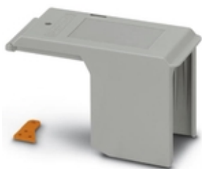
Covering hood, length: 144 mm, width: 41 mm, height: 33 mm, color: gray

Please be informed that the data shown in this PDF Document is generated from our Online Catalog. Please find the complete data in the user's documentation. Our General Terms of Use for Downloads are valid ( http://phoenixcontact.com/download )