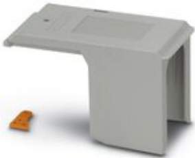
Covering hood, length: 164 mm, width: 49 mm, height: 33 mm, color: gray

Please be informed that the data shown in this PDF Document is generated from our Online Catalog. Please find the complete data in the user's documentation. Our General Terms of Use for Downloads are valid ( http://phoenixcontact.com/download )