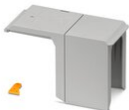
Covering hood, length: 164 mm, width: 54.8 mm, height: 33 mm, color: gray

Please be informed that the data shown in this PDF Document is generated from our Online Catalog. Please find the complete data in the user's documentation. Our General Terms of Use for Downloads are valid ( http://phoenixcontact.com/download )