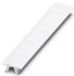
Zack marker strip, Strip, white, labeled, can be labeled with: Plotter, Printed horizontally: Consecutive numbers 1 - 10, 11 - 20, etc. up to 491 - 500, Mounting type: Snap into tall marker groove, for terminal block width: 6.2 mm, Lettering field: 6.15 x 10.5 mm

Zack marker strip - ZB 6,LGS:FORTL.ZAHLEN - 1051016