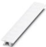
Zack marker strip, Strip, white, labeled, can be labeled with: Plotter, Printed horizontally: Identical numbers 1 or 2, etc. up to 100, Mounting type: Snap into tall marker groove, for terminal block width: 6.2 mm, Lettering field: 6.15 x 10.5 mm

Zack marker strip - ZB 6,LGS:GLEICHE ZAHLEN - 1051032