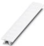
Zack marker strip, Strip, white, labeled, can be labeled with: Plotter, Printed vertically: Consecutive numbers 1 - 10, 11 - 20, etc. up to 491 - 500, Mounting type: Snap into tall marker groove, for terminal block width: 6.2 mm, Lettering field: 6.15 x 10.5 mm

Zack marker strip - ZB 6,QR:FORTL.ZAHLEN - 1051029