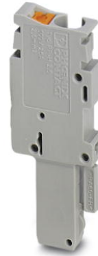
Image shows the version in gray

http://catalog.phoenixcontact.net/phoenix/treeViewClick.do?UID=3210101