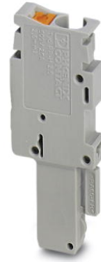
Image shows the version in gray

http://catalog.phoenixcontact.net/phoenix/treeViewClick.do?UID=3210143