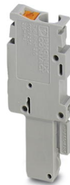
Image shows the version in gray

http://catalog.phoenixcontact.net/phoenix/treeViewClick.do?UID=3210127