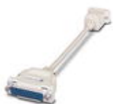
RS-232 cable, 9-pos. D-SUB socket 25-pos on D-SUB socket

Data cable - PSM-KA 9 SUB 25/BB/2METER - 2761059