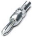
Test plugs, Color: silver