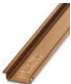
DIN rail, material: Copper, unperforated, height 7.5 mm, width 35 mm, length: 2 m

DIN rail, unperforated - NS 35/ 7,5 CU UNPERF 2000MM - 0801762