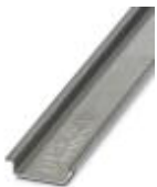
DIN rail, unperforated, Width: 35 mm, Height: 7.5 mm, Length: 2000 mm, Color: silver

DIN rail, unperforated - NS 35/ 7,5 AL UNPERF 2000MM - 0801704