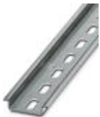
DIN rail, material: Galvanized, perforated, height 7.5 mm, width 35 mm, length: 2 m

DIN rail perforated - NS 35/ 7,5 ZN PERF 2000MM - 1206421