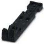
Strain relief, Number of positions: 2, Color: black